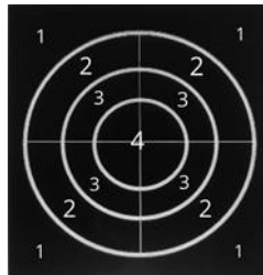
Figure 1. Target media instruments

scoring zones, where participants received scores based on the accuracy of the ball reaching the designated target area. The scoring criteria ranged from 1 to 4 points, where: (1) very inaccurate pass, (2) less accurate pass, (3) accurate pass, and (4) highly accurate pass (Rizqi et al., 2024).